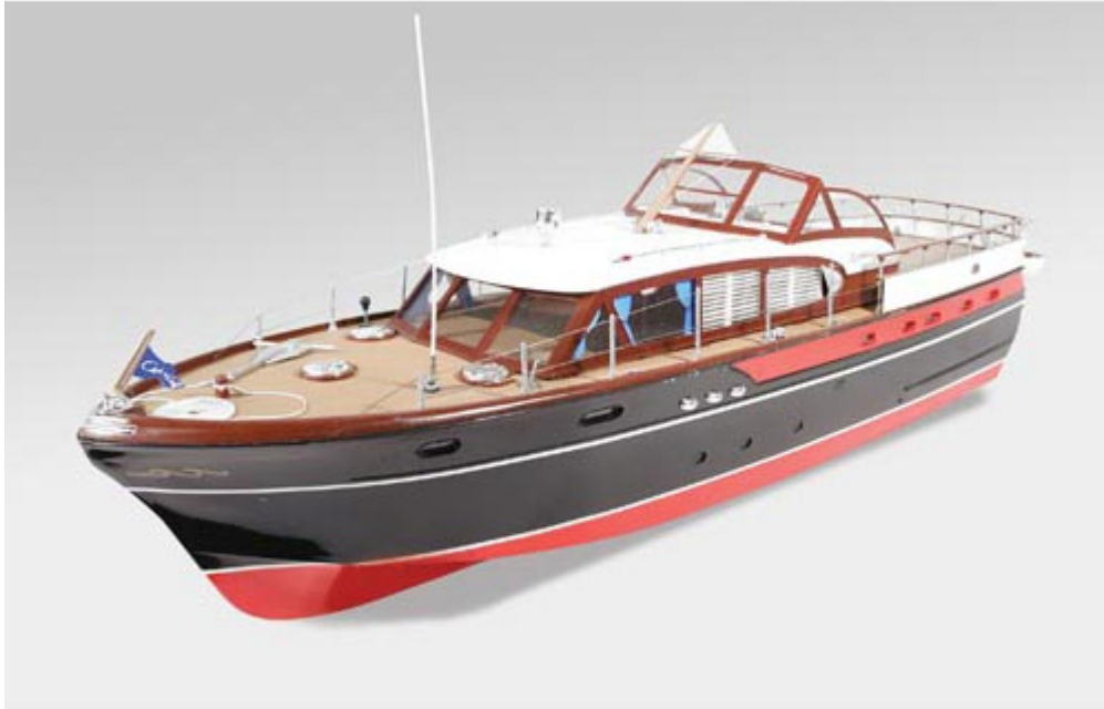
The 30 inch long Chris Craft Constellation.

Also announced at the Chicago Show for 2012 was a big 1/72 scale USS Skipjack class submarine model, by Moebius Models. This is a big plastic model, and one that is designed for easy conversion to RC. The RC sub suppliers are apparently already working on running gear kits for it. This kit is expected to be out in the first quarter of 2012, and will retail for $120.