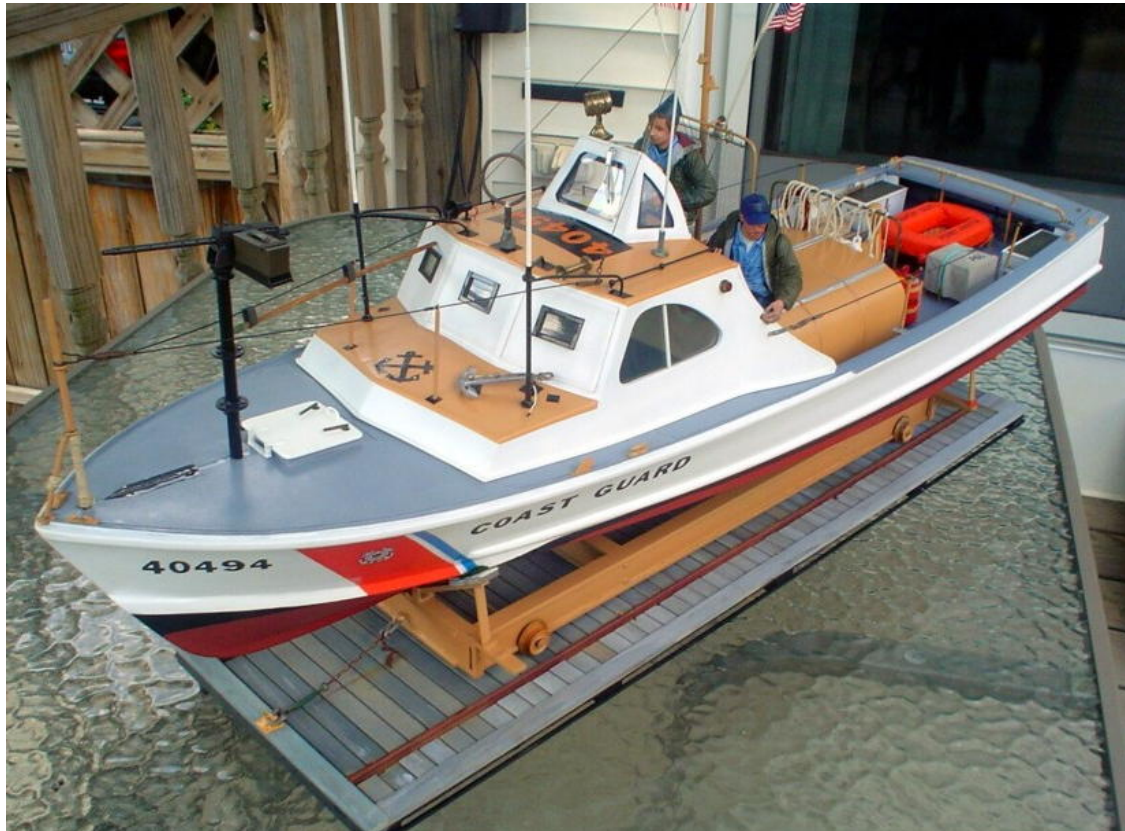
Mike Maynard's Dumas USCG Forty foot utility boat, Point Judith's 40494 (his first r/c model).

I still dabble in r/c sized ship models but they're built as static displays and like my operating boats, most are US Coast Guard prototypes. These days I'm involved with the Coast Guard Heritage Museum on Cape Cod and have a number of my models on display. I've provided some photos of my work for your inspection.