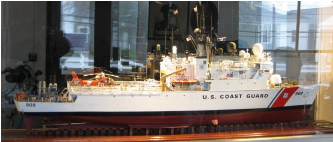
Mike's USCGC CAMPBELL, 1:48 scale, scratch built as an R/C model, in its new "homeport" at the USCG Heritage museum, Barnstable Massachusetts.

Laser Cut Hull Kits: I found another little model boat vendor this month while poking about the internet.