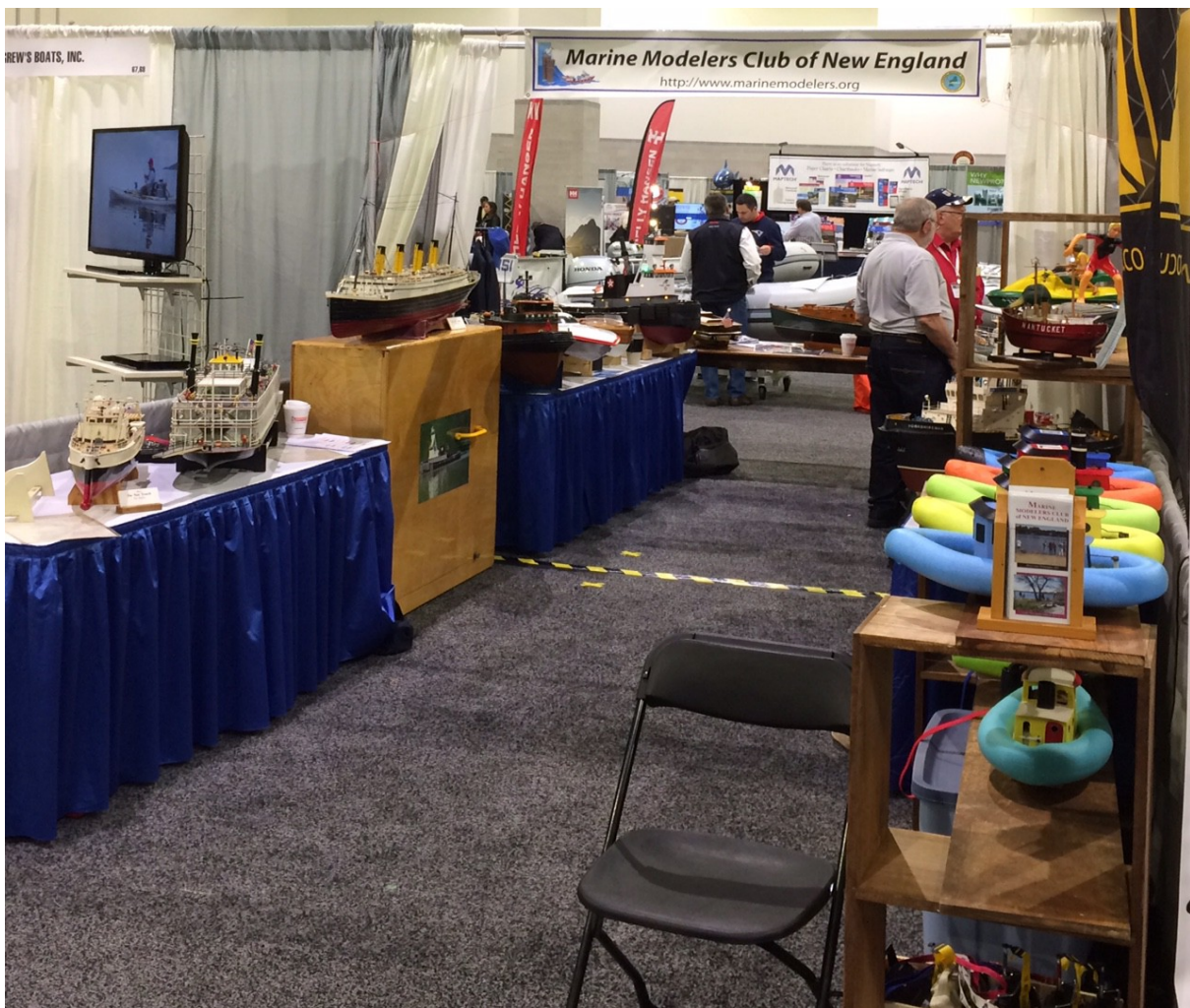
Above: Our booth, ready for the show to open.

The popularity of the pool last year led the Show Organizers to move the pool from the back of the hall to the center, next to the bar area. Our club booth was also more centrally located, directly across the aisle from the pool. Originally we only had a 10x10 space, and were a bit concerned about how many models we could accommodate on display. But the week before the show, we got word we were getting a double booth, so we had plenty of room for all the models people wanted to bring.