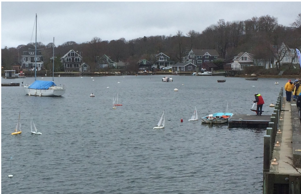
Left: Sailboat racing on Eel Pond.

A variety of classes were sailed over the course of the weekend.