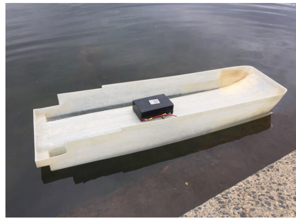
Left: USNS Spearhead (JHSV-1) Right: Displacement testing the hull.