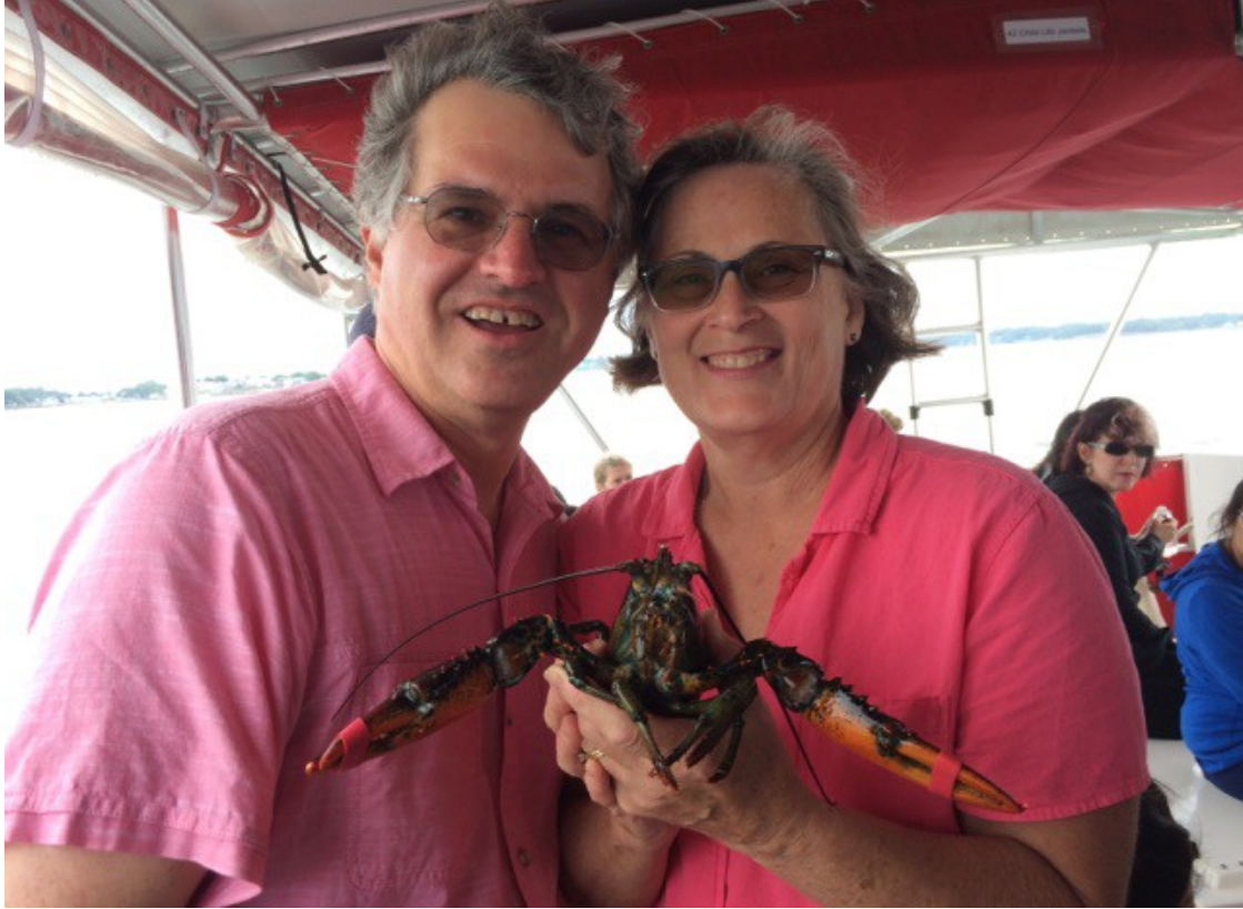
Above: We had to give him back, but it was OK, as we didn't have any melted butter with us. Below: This is how you get a 5-foot long Ocean Liner home!