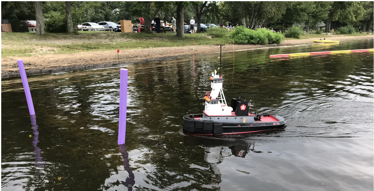
Below: Charlie's big tug approaches the "Bow and Stern Touch"-- it was the most challenging part of the course!