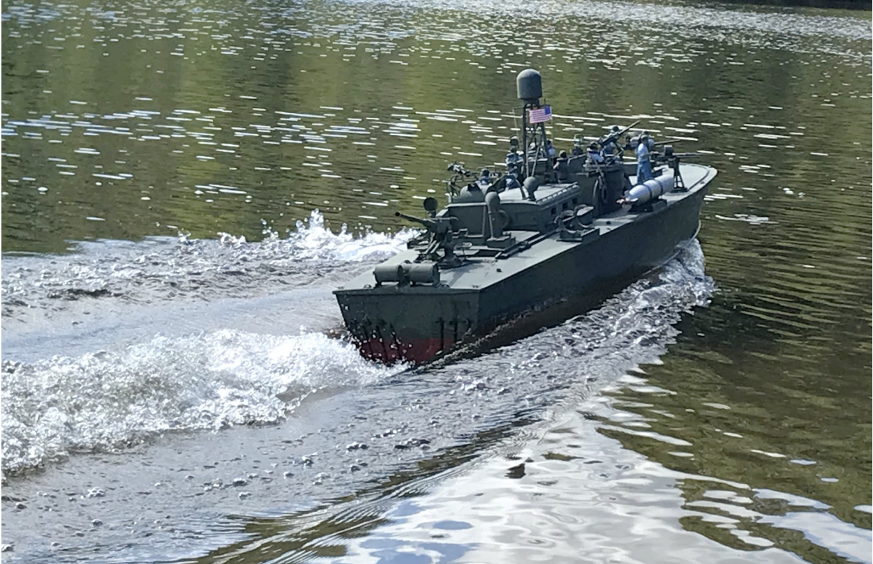
Above: Jonathan Eno's big Elco 80 foot PT Boat looked great at speed! Below: Glenn Williams' 1/96 scale Buoy Tender USCGC Willow.